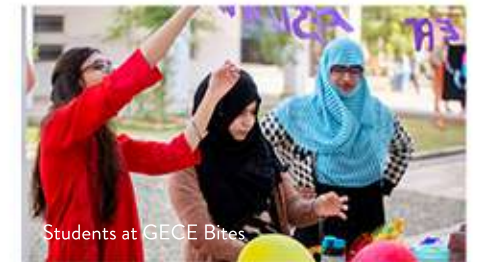
Students at GECE Bites