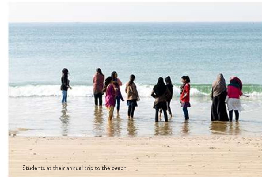
Students at their annual trip to the beach

“Teachers here do not follow the typical educational norm. We have a friendly approachable environment” Amna Javed Student GECE