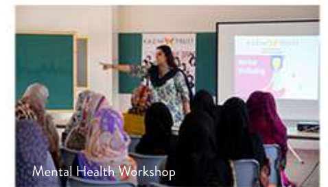
Mental Health Workshop