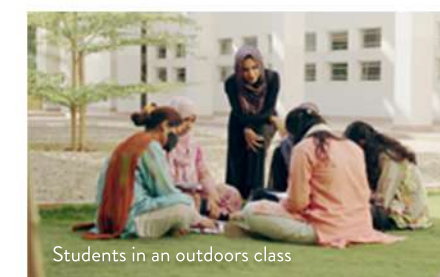
Students in an outdoors class