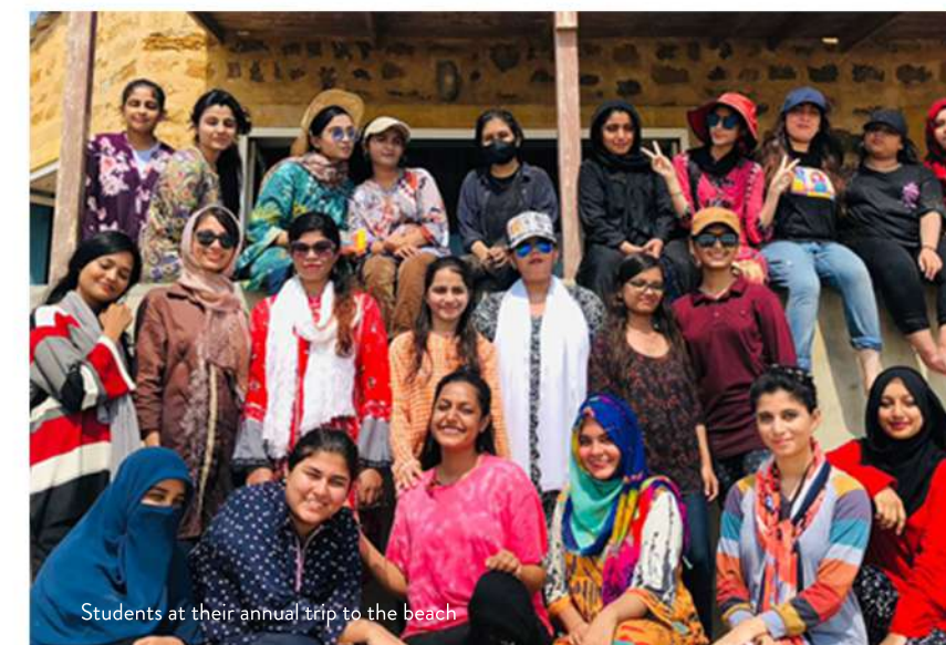
Students at their annual trip to the beach