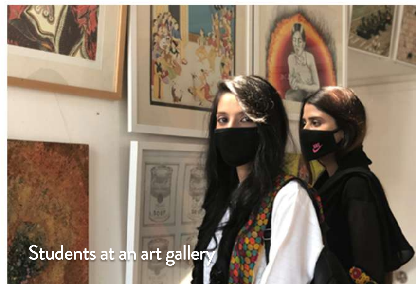
Students at an art gallery