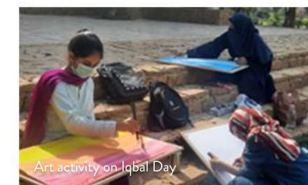
Art activity on Iqbal Day