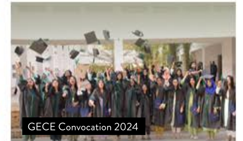
GECE Convocation 2024