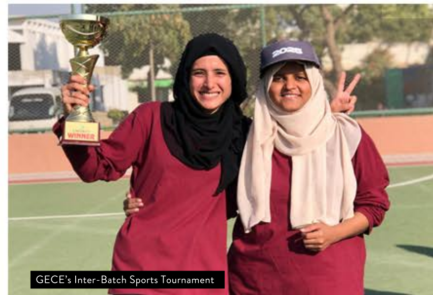
GECE's Inter-Batch Sports Tournament