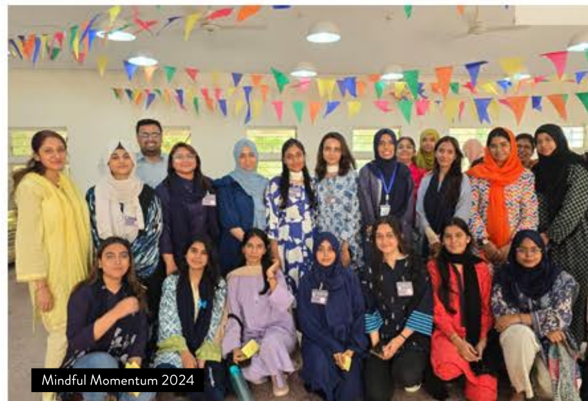
Mindful Momentum 2024