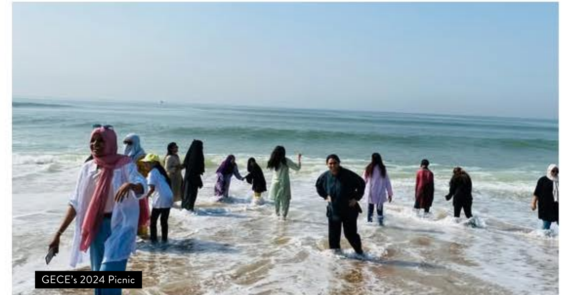
GECE's 2024 Picnic