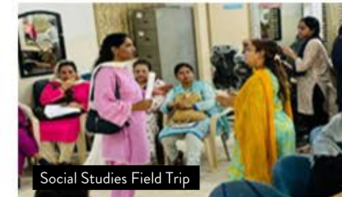
Social Studies Field Trip